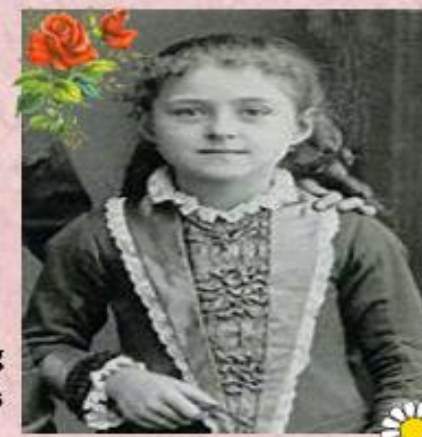
St. Therese The Little Flower

"I pray like Children who Do not know How to read, I Say very simply To God what I wish to say, Without composing Beautiful sentences And he always Understands me."