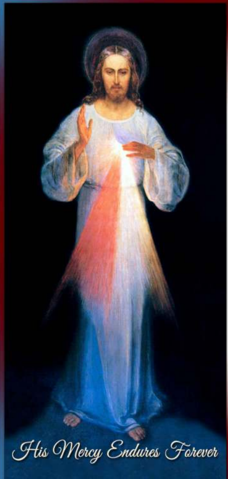
His Mercy Endures Forever